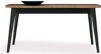
Dining Table Extendable W: 1600-2000 H: 767 D: 900