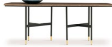
Dining Table W: 2050 H: 1030 D: 763