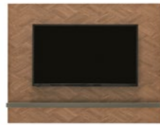
Back Panel W: 1366 H: 1056 D: 136