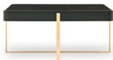
Dorian Coffee Table W: 957 H: 439 D: 957