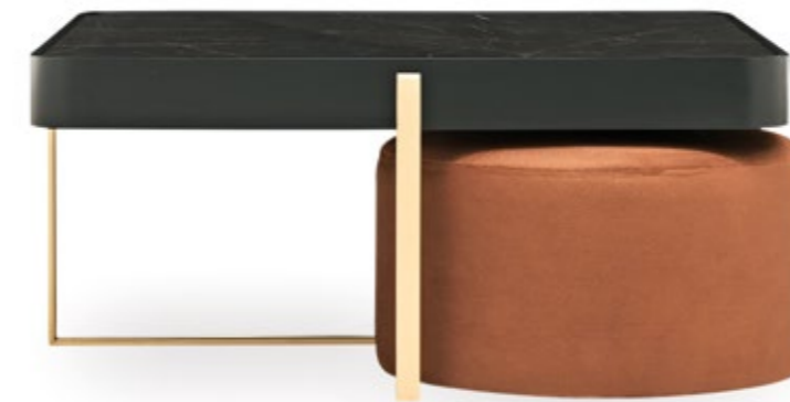
Dorian Coffee Table And Living Room Ottoman