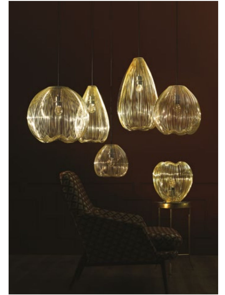
Wire Gold Pendant Lamp, Lampshade