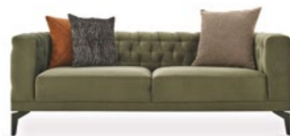
2-Seat Sofa W: 2130 H: 770 D: 930