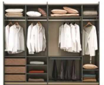
Wardrobe With Sliding Doors (260 cm)