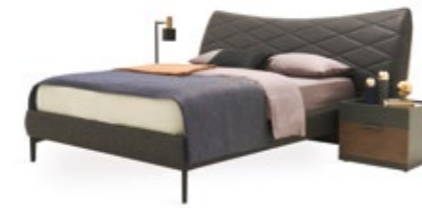
Bed Frame (160x200 cm) W: 1740 H: 400 D: 2100