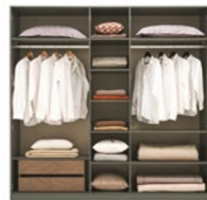
5 Doors Wardrobe