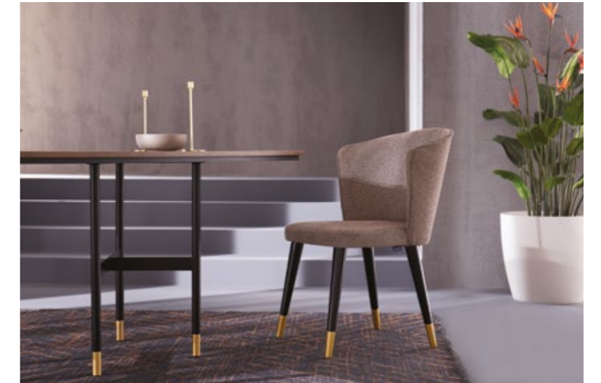
Dining Table (Fixed)

DORIAN DINING ROOM brings a stylized touch of functionality with a modern and stylish handle-less sideboard design, as well as a metal-leg fixed and wooden-leg extendable table alternatives.