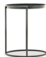
Dorian Side Table W: 468 H: 552 D: 468