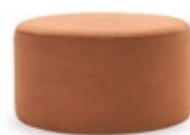
Ottoman W: 540 H: 310 D: 540