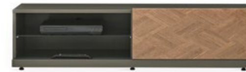
Open Shelf TV Bench

If you have a small space, you can only use the TV bench modules of the DORIAN TV UNIT.