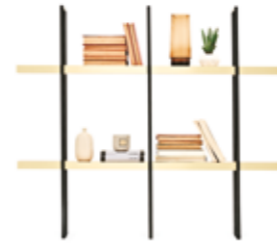
Metal Shelf Module W: 1204 H: 1056 D: 234