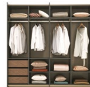
Wardrobe With Sliding Doors (220 cm)