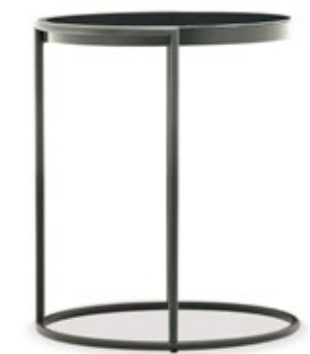
Dorian Side Table