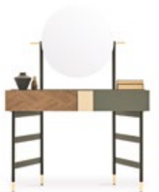
Dressing Table - Mirror W: 1106 H: 1493 D: 485