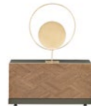
Single Module W: 690 H: 354 D: 468