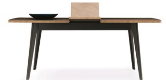
Dining Table (Extended)

DORIAN DINING ROOM brings a stylized touch of functionality with a modern and stylish handle-less sideboard design, as well as a metal-leg fixed and wooden-leg extendable table alternatives.