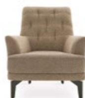
Armchair W: 800 H: 930 D: 550