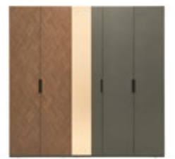
5 Doors Wardrobe W: 2264 H: 2215 D: 612