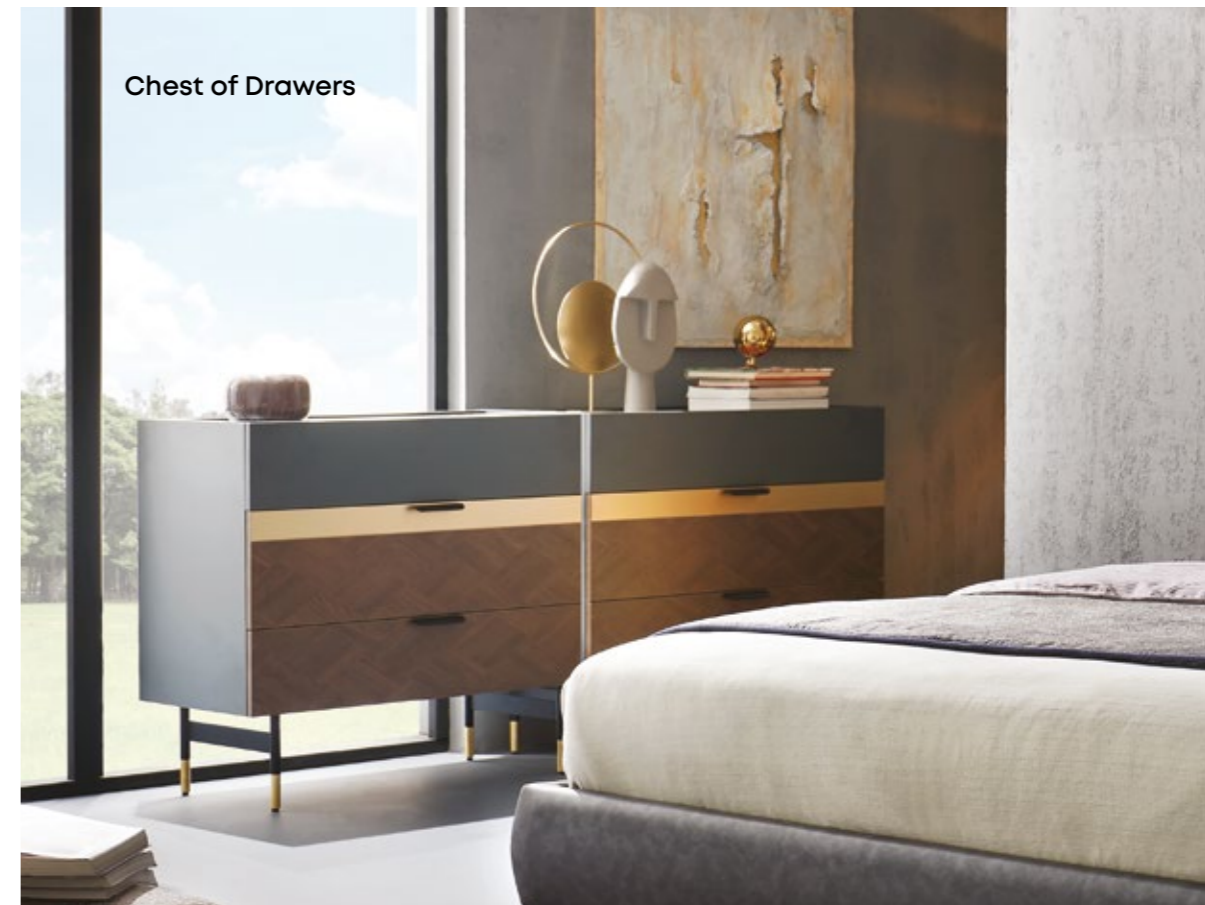
Chest of Drawers