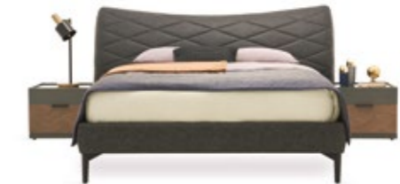
Bed / Base Headboard (160x200 cm) W: 2270 H: 1210 D: 290