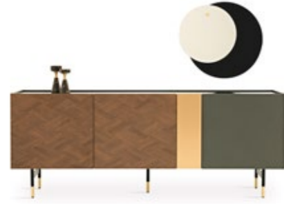
Sideboard / Mirror Sideboard : W: 2071 H: 800 D: 501 Mirror : W: 800 H: 730 D: 37