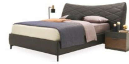
Steel Base With Storage(160x200 cm) W: 1740 H: 400 D: 2100