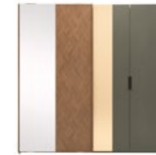
Wardrobe with Sliding Doors (220 cm) W: 2194 H: 2215 D: 675