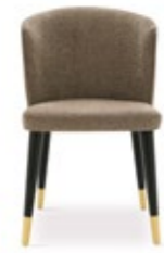
Dorian Chair W: 535 H: 635: 855